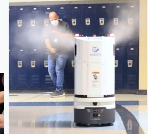
Raised $1M Seed Raising $4M Series