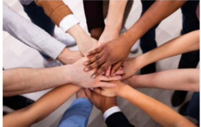
Teamwork makes the Dreamwork!